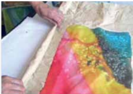
Roll the two elements together, taking care of creases (risk of marking)

Place the silk square on the protective paper or cotton canvas (the protective paper must be longer than the piece of silk so that you can roll it several times after the work has been completely wound up).