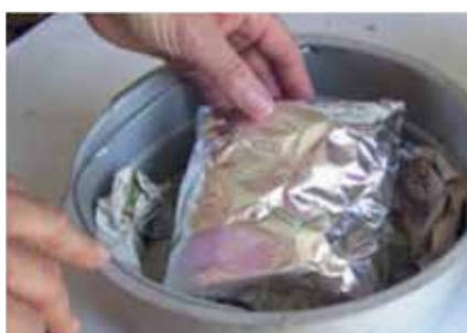
Place the protected roll of silk in the basket then cover with a sheet of aluminum foil to protect it from condensed water drops.