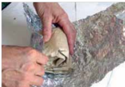
Carefully wrap the roll in aluminum foil