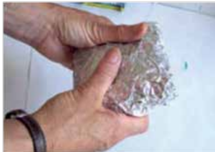
Add a second layer of foil