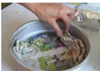
Cover the basket holes with a page of protective paper (parboiling paper or similar)