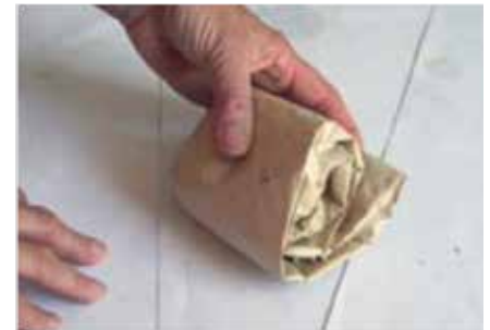
Then roll the assembly on itself (keep the folding flexible. If too tight, there is a risk of marking the folds)